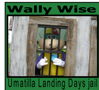
Wally Wise Umatilla Landing Days jail