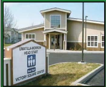
Victory Square Center