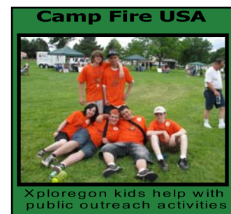
Camp Fire USA Xploreon kids help with public outreach activities